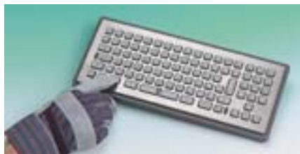
H=42, W=366, D=155